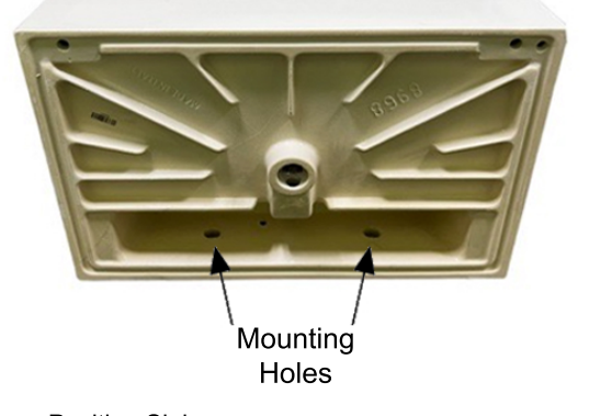
Position Sink over screws